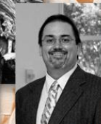
Moderated by Ben Brotemarkle