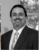
Moderated by Ben Brotemarkle