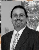
Moderated by Ben Brotemarkle