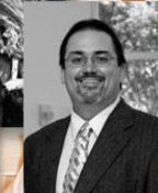
Moderated by Ben Brotemarkle