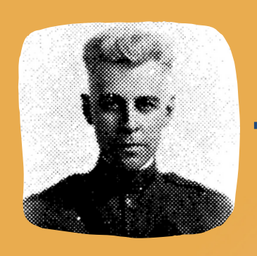
THE STATE OF FLORIDA RULES THAT WHITE WOMEN CAN ATTEND UF