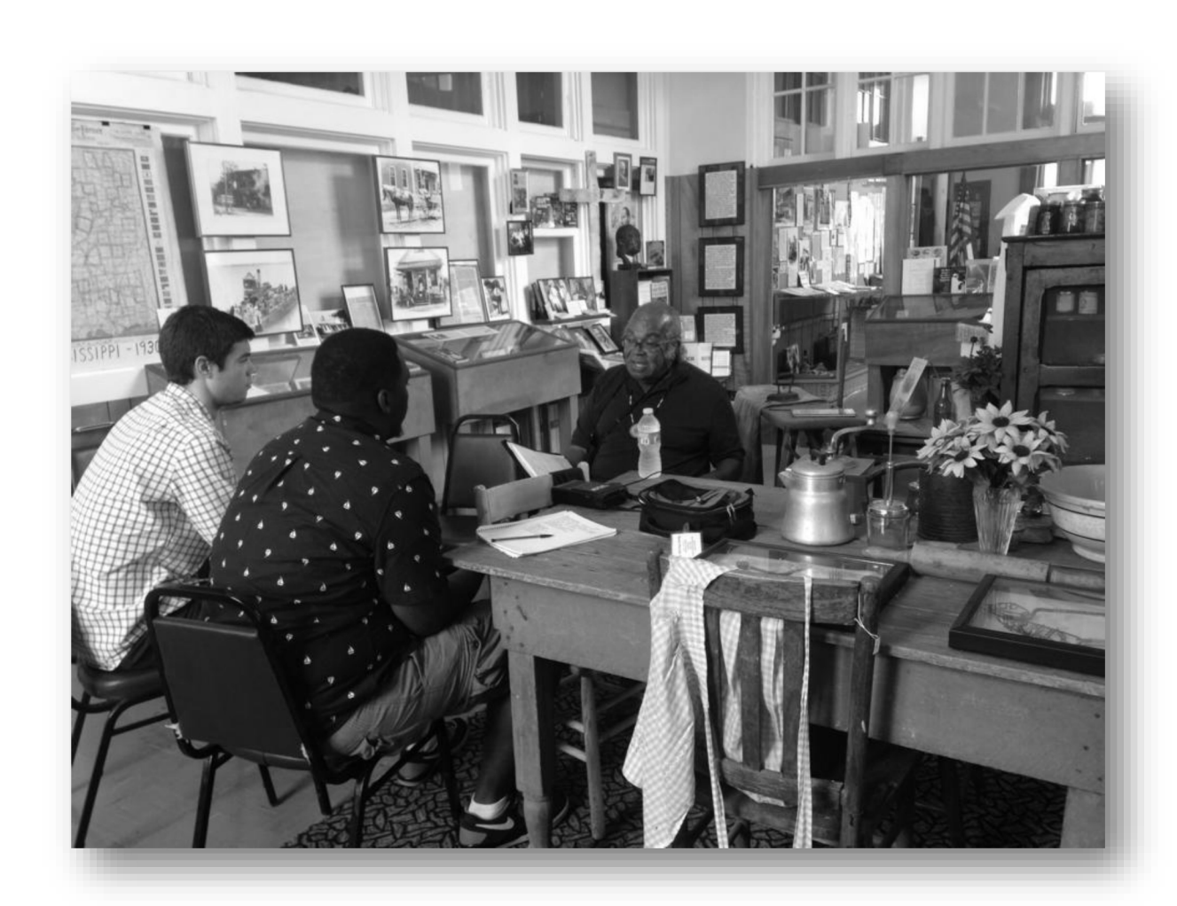
JUNE 24, 2014