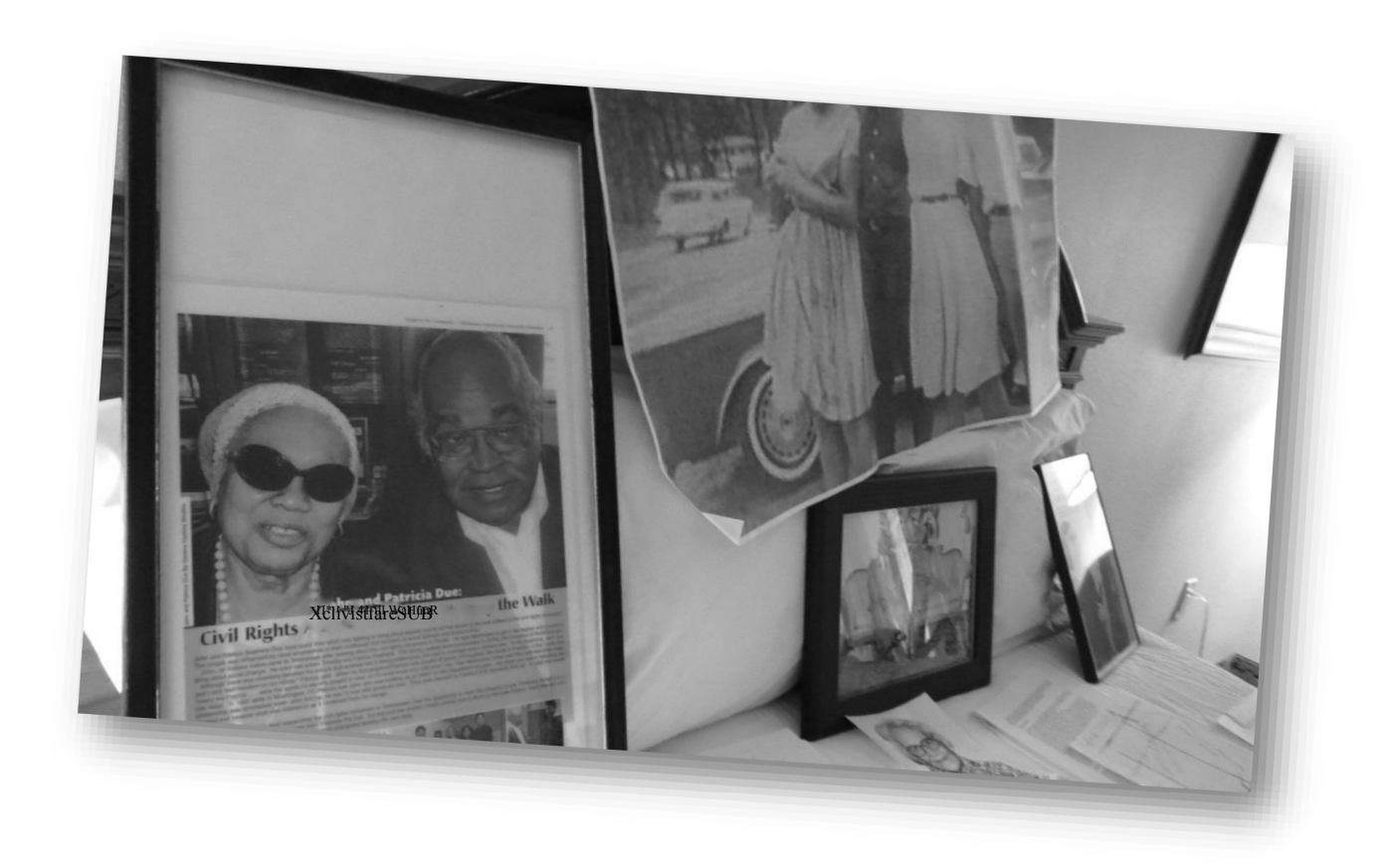
October 5, 2013